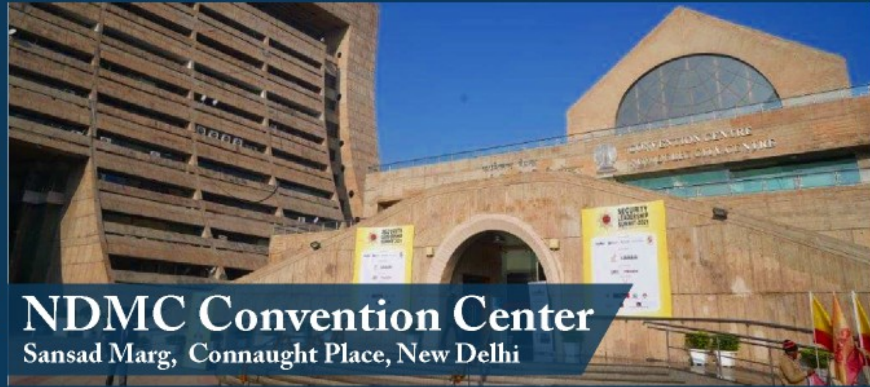
NDMC Convention Center Sansad Marg, Connaught Place, New Delhi

The Venue is located very close to the Connaught Circus, Connaught Place, Windsor Place, Gole Market, Barakhamba Avenue.