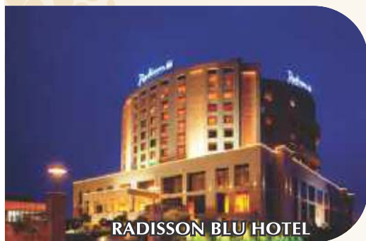
RADISSON BLU HOTEL

22 nd – 24 th February 2013, Radisson Blu Hotel, Dwarka, New Delhi Live Surgeries relayed from Cygnus Bensups Hospital