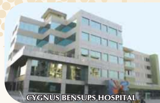
CYGNUS BENSUPS HOSPITAL

30 FOREIGN FACULTY WITH 70 NATIONAL FACULTY