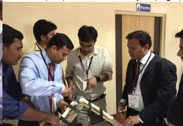
A & B. ISKSAA meeting – Teaching at hip and knee arthroplasty workshops