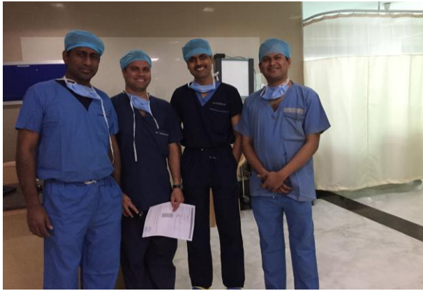
A. At Ganga Hospital orthopaedic operation theatre complex