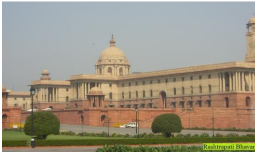
Rashtrapati Bhawan (President's House)