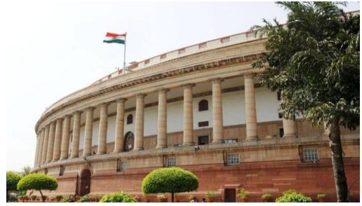
Sansad Bhavan (The Parliament)