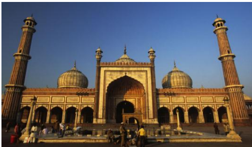
Jama Masjid (Mosque)