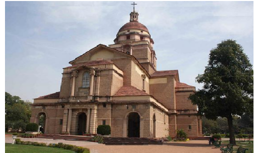
Cathedral Church of the Redemption