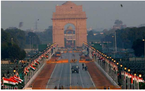
India Gate & Rajpath