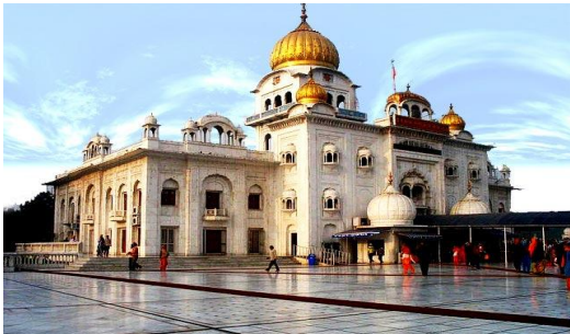
Bangla Sahib Gurudwara