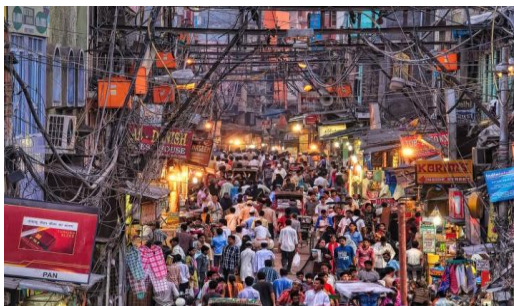
Chandni Chowk (Market Place)